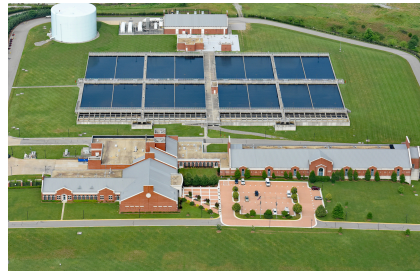
Left: The main entrance of the Griffith Water Treatment Plant. Right: An aerial shot of the Griffith Water Treatment Plant main facility and its drinking water treatment basins.